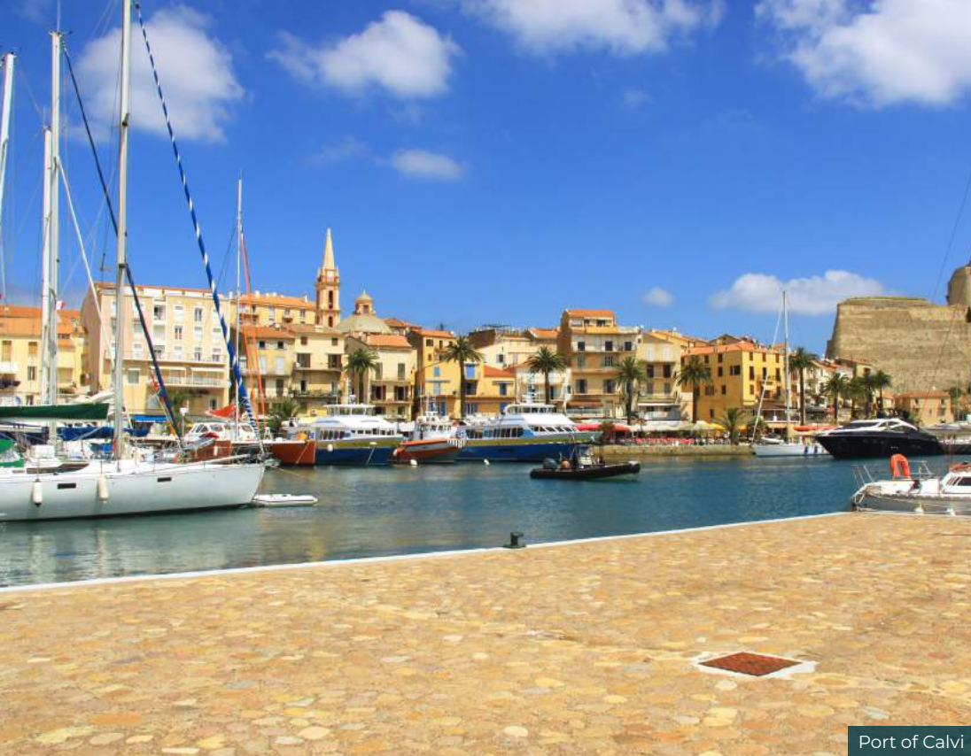
Port of Calvi