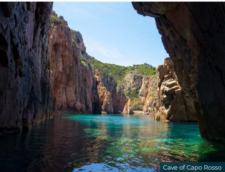
Cave of Capo Rosso