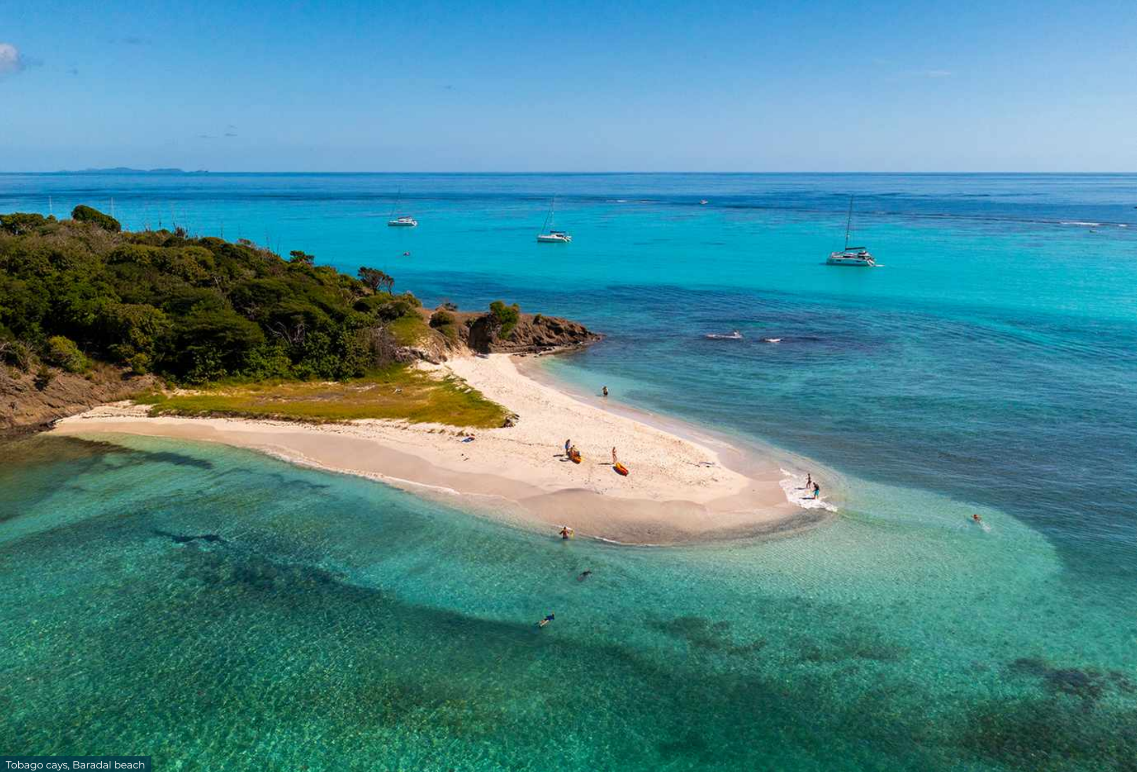
Tobago cays, Baradal beach