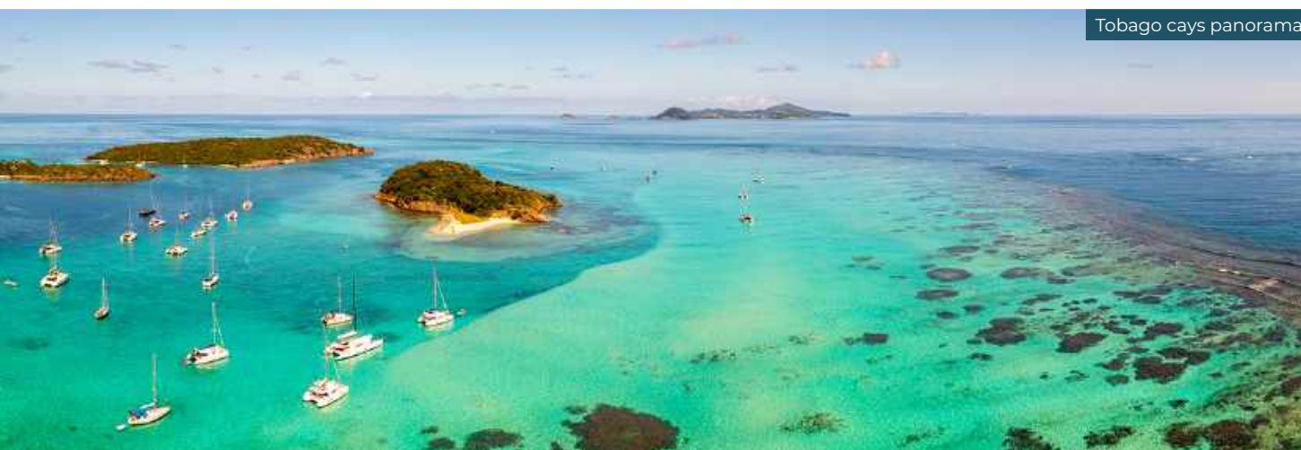
Tobago cays panorama