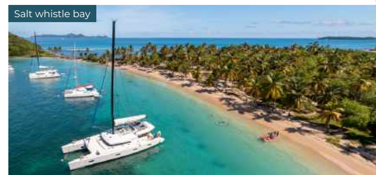
Salt whistle bay