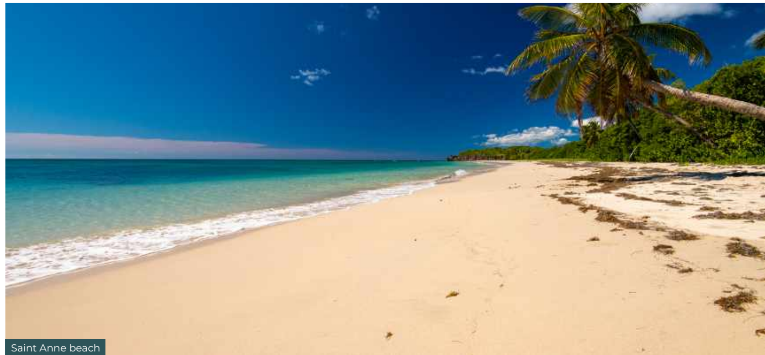
Saint Anne beach