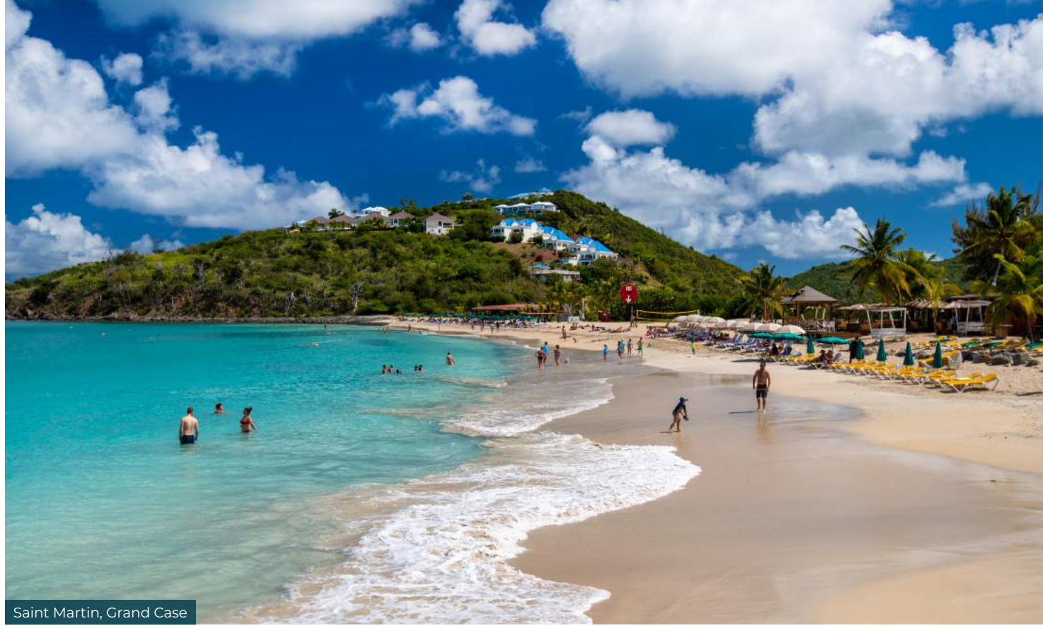
Saint Martin, Grand Case

This catamaran cruise, a delicious cocktail of turquoise islands, will give you a restful change of scenery. Sailings of up to three hours, with stopovers alternating between idleness on white sandy beaches ranked among the most beautiful in the world, swimming in nature reserves inhabited by sea turtles, strolls through pretty, welcoming villages and Caribbean evenings. You'll love the immense white-sand beaches of the Anguilla archipelago, the friendly, unspoilt nature of Saint Barthelemy, snorkeling and discovering coral, turtles and fish on Ile Fouchue, Ile de Tintamarre and Rocher Créole, and the best spots on Saint-Martin: Orient Bay, Ilet Pinel and Grand Case.