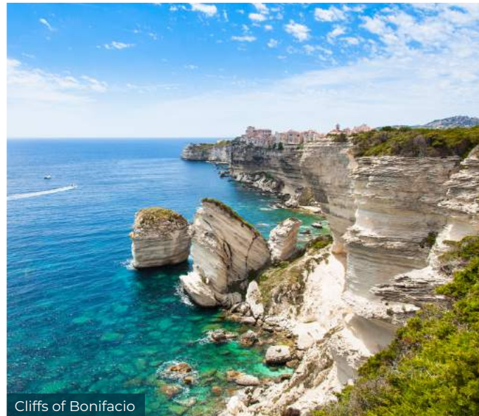
Cliffs of Bonifacio