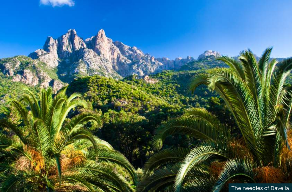
The needles of Bavella