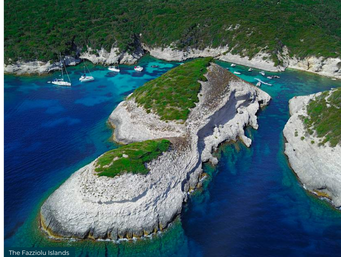
The Fazziolu Islands