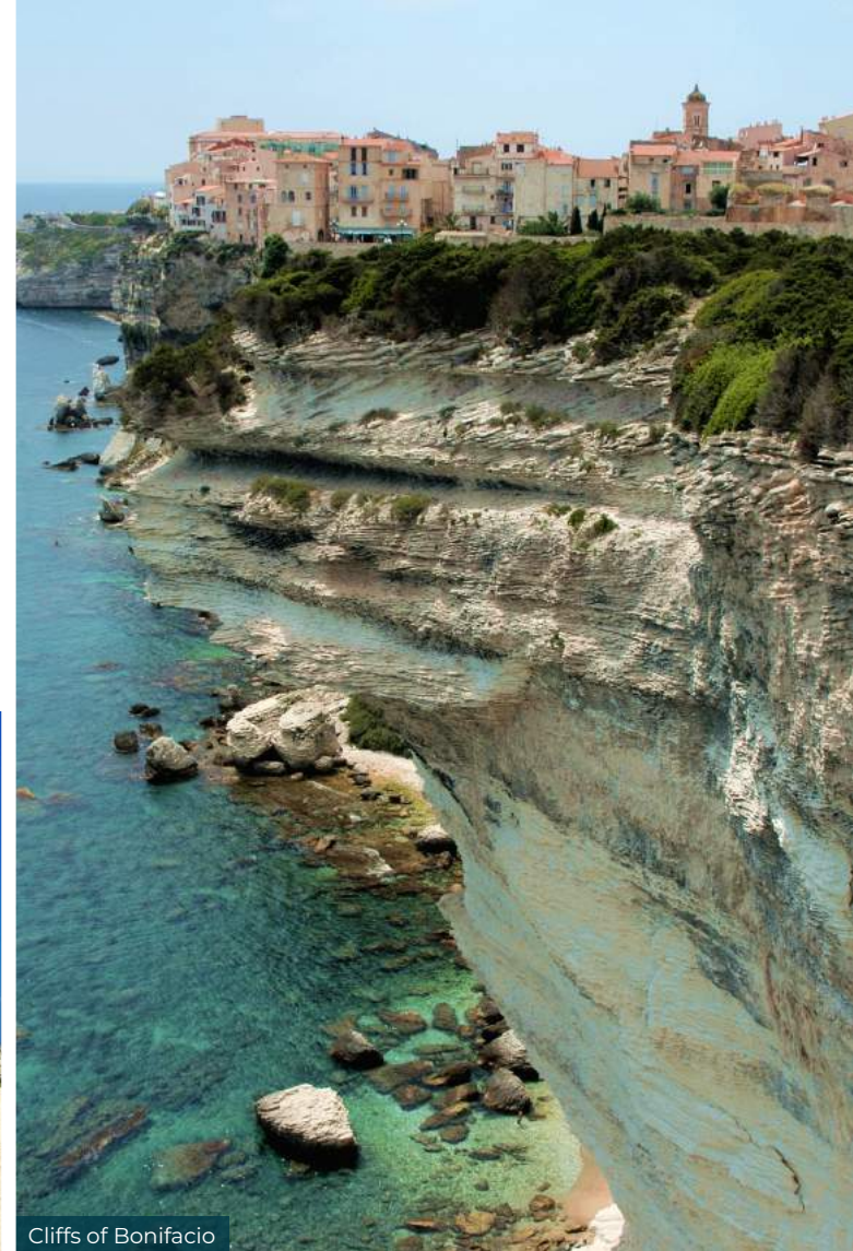
Cliffs of Bonifacio