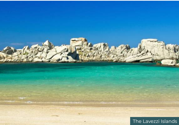
The Lavezzi Islands

Boarding your catamaran in Ajaccio from 6pm, installation in your cabins. Welcome cocktail. Dinner and overnight at anchor.