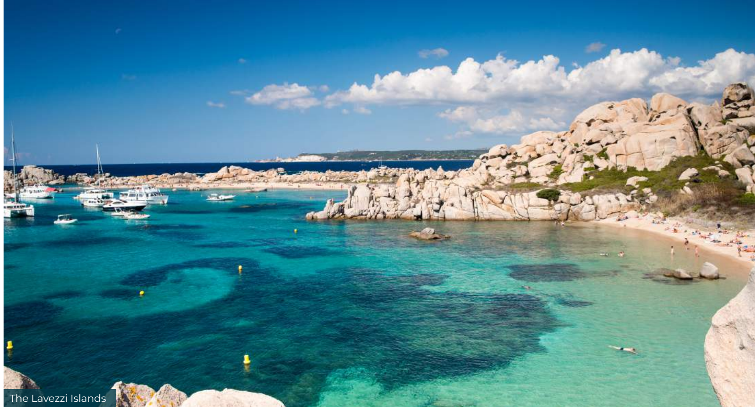
The Lavezzi Islands

+33 (0)1.55.20.90.90, 9am-8pm, 7 days a week www.catlante.com