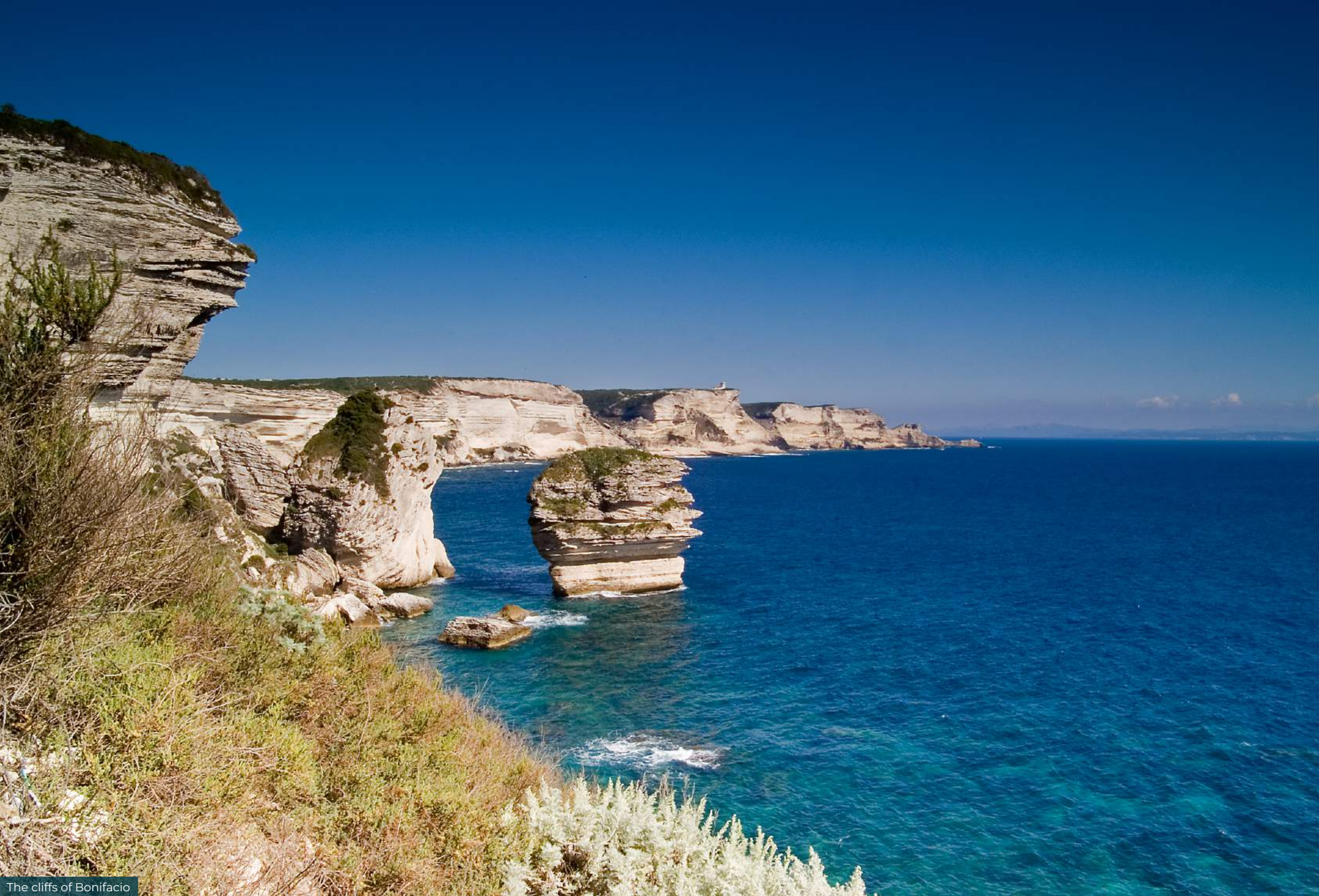
The cliffs of Bonifacio