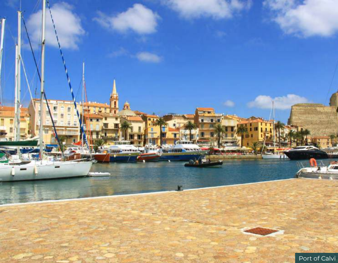
Port of Calvi