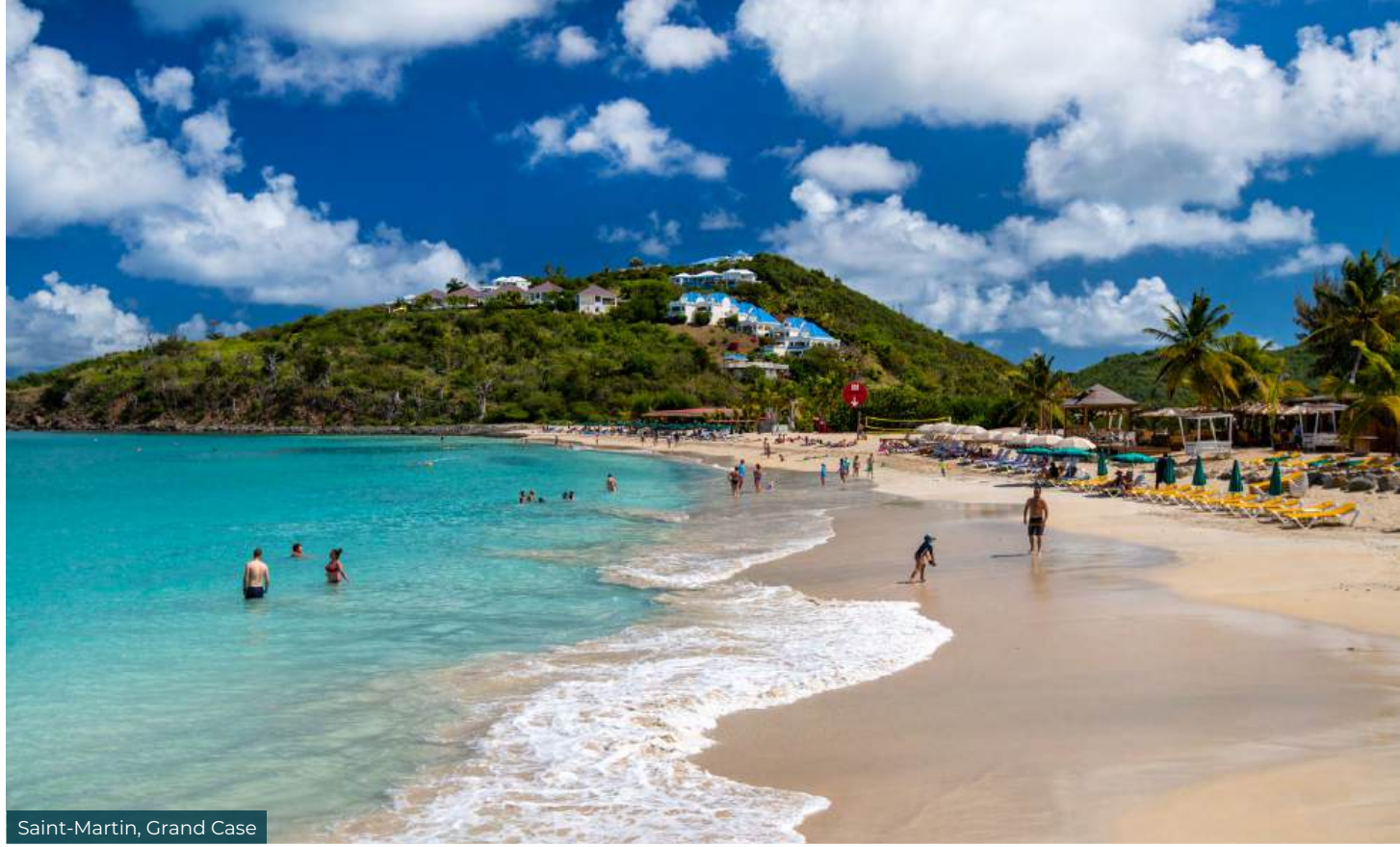
Saint-Martin, Grand Case

This catamaran cruise, a delicious cocktail of turquoise islands, will give you a restful change of scenery. Sailings of up to three hours, with stopovers alternating between idleness on white sandy beaches ranked among the most beautiful in the world, swimming in nature reserves inhabited by sea turtles, strolls through pretty, welcoming villages and Caribbean evenings. You'll love the immense white-sand beaches of the Anguilla archipelago, the friendly atmosphere and wonderfully preserved nature of Saint Barthélemy, and the snorkeling discoveries among corals, turtles, and tropical fish around Île Fourchue, Anse Colombier, and Grand Case, considered one of the best spots in St Martin.